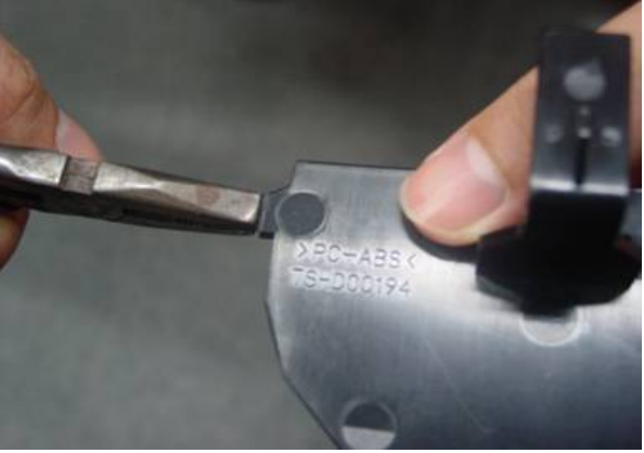
Slot in/ Insert the paper guide into A and B locations and press it downwards by finger as shown in the picture.